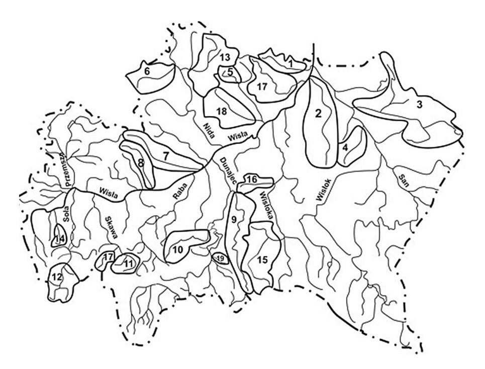
Figure 1. Location of analyzed catchments in Upper Vistula basin

The study material included daily flows from the multi-year period of 1963–1983 collected for 19 catchments (Fig. 1). At least 10 – years long observational daily flows was a criterion for catchments chosen. located in the upper Vistula basin and characterized by specific physiographic and meteorological parameters (Table 1). For analysis 11 physiographic and meteorological parameters of the catchment were investigated: length of the watercourse (L), catchment area (A), mean annu-