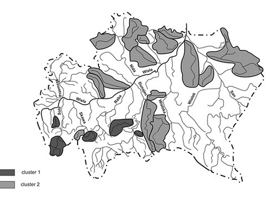
Figure 2. Localization of the investigated catchments forming the clusters identified with K-means method